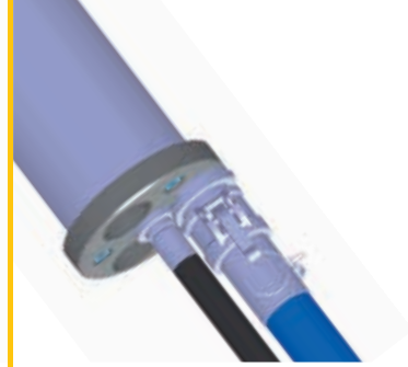
no aerial valve block